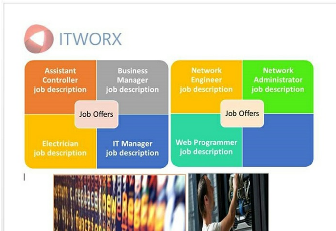
Figure 1. Job offer lure (MD5: 43fad2d62bc23ffdc6d301571135222c).

Recipients who clicked the URL were presented a Microsoft Office document related to the phishing theme (see Figures 1 and 2).