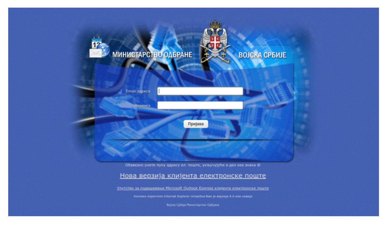
Figure 1 - Serbian Ministry of Defence phishing page mail[.]mod[.]qov[.]rs

Our journey began when hunting for newly registered domains with TLS certificates that use the term 'qov', spoofing the legitimate term 'gov'. Spoofing the word 'gov' has previously been a favoured technique of several unrelated threat actors, such as Blue Athena (a.k.a. Sofacy, APT28)<sup>1</sup>. On 31st January 2021, we observed the subdomain mail[.]mod[.]qov[.]rs being used to phish for Serbian Ministry of Defence credentials. The phishing page shown in Figure 1 when visited not only logged credentials, but logged visits to the phishing page itself.