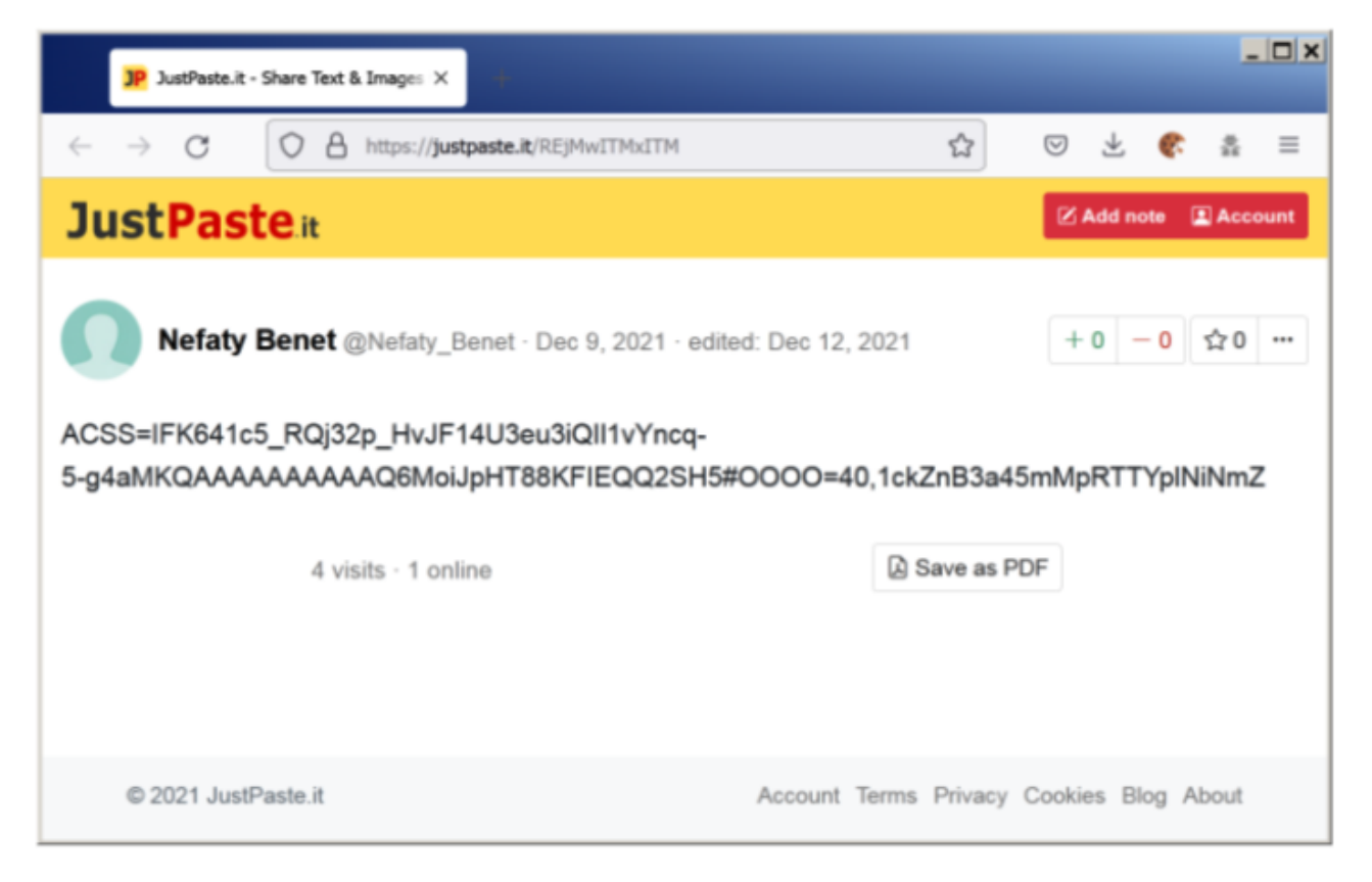
Figure 5. Example of JustePastelt paste content.

The data taken from the paste service is split by "#" and then each split by "=" to form the following two key-value pairs.