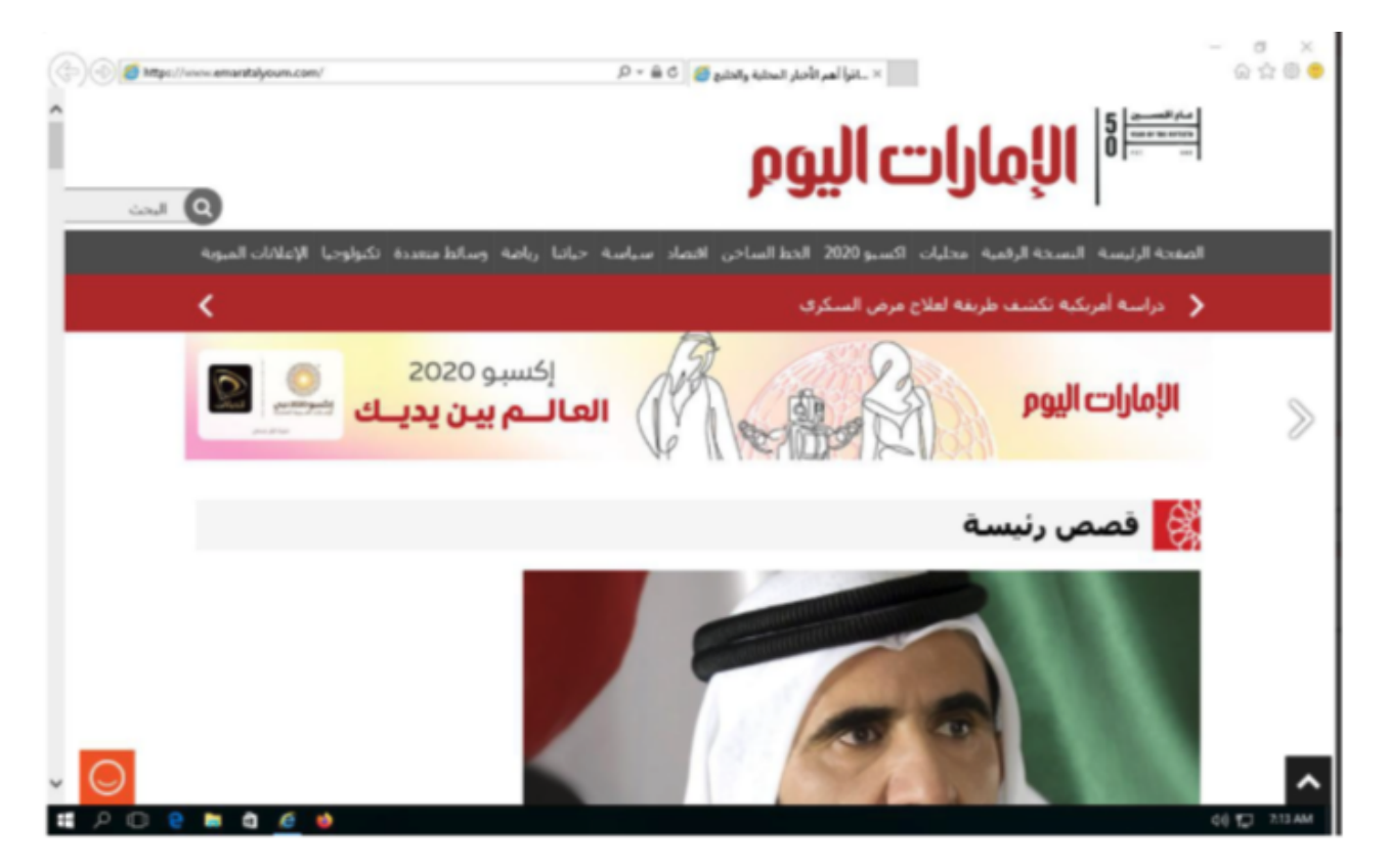
Figure 2. Benign redirect to legitimate news site https[:]www[.]emaratalyoum[.]com.

https[:]//www[.]uggboots4sale[.]com/news15112021.php, in the phishing email was geofenced to the targeted countries. If the target's IP address fits into the targeted region, the user would be redirected to the RAR file download containing the latest TA402 implant, NimbleMamba. If outside the target area, the user would be redirected to a legitimate news site, Figure 2.