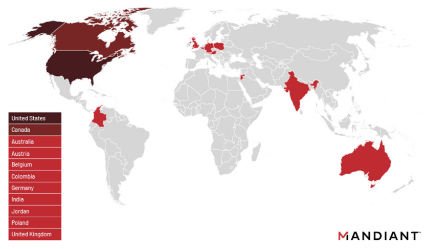
Figure 2: Alleged COLDDRAW victims by country