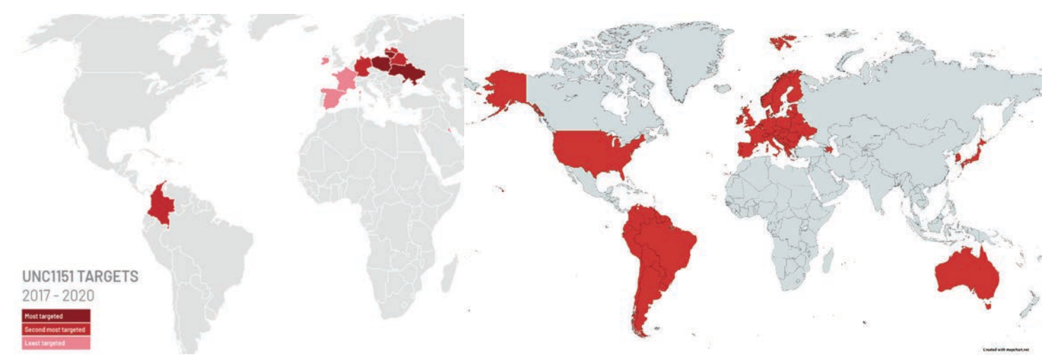
Figure 1: Overview of UNC1151 targets (left) and APT28 and Sandworm targeting (right)