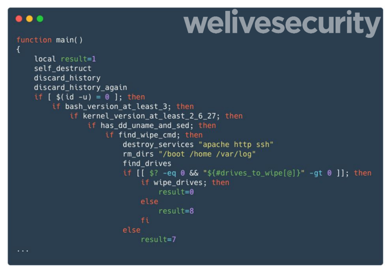
Figure 11. Deobfuscation of the above obtained by renaming functions and variables and using literals