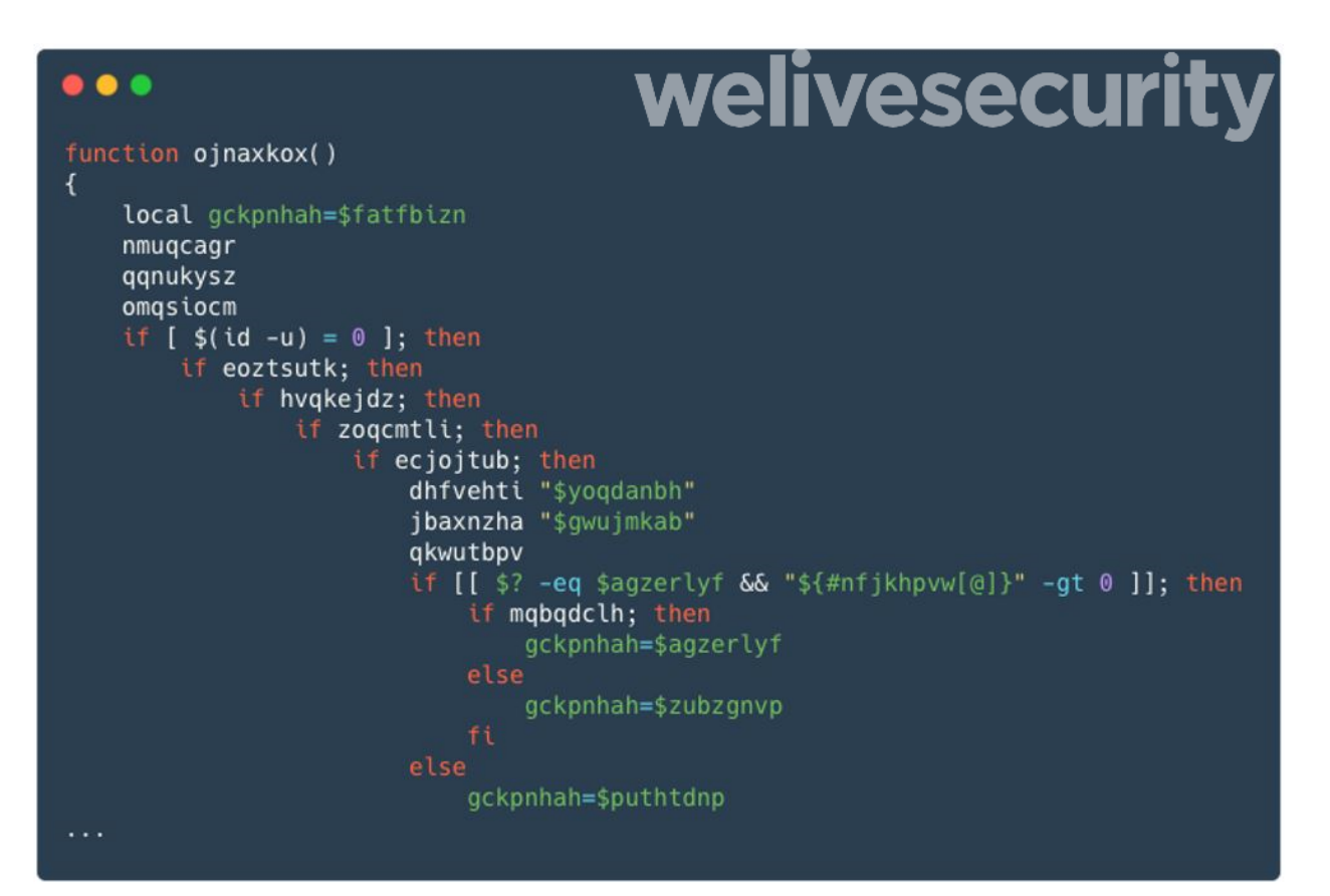
Figure 10. Except from the obfuscated script (whitespace optimized).