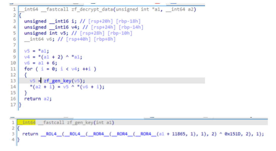
Figure 3 — XOR algorithm and key generation function from an IcedID sample

Additionally, samples of both IcedID and MountLocker were identified which contained almost identical XOR decryption and key generation algorithms.