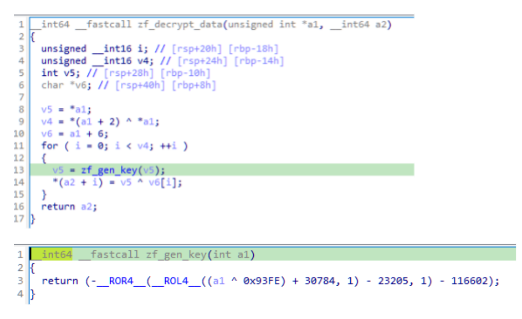
Figure 4 — XOR algorithm and key generation function from a MountLocker sample