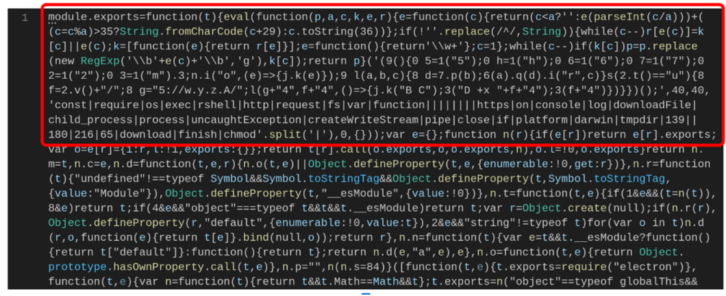
Figure 2. Backdoored electron-main.js file.

This code, executed at the runtime, checks if the environment is MacOS (darwin) and then downloads the "rshell" implant from 139.180.216.65, an IP address already associated to LuckyMouse HyperBro C2. The retrieved payload is written in the temp folder, chmoded with execution permission and then, executed as shown in the deobfuscated code: