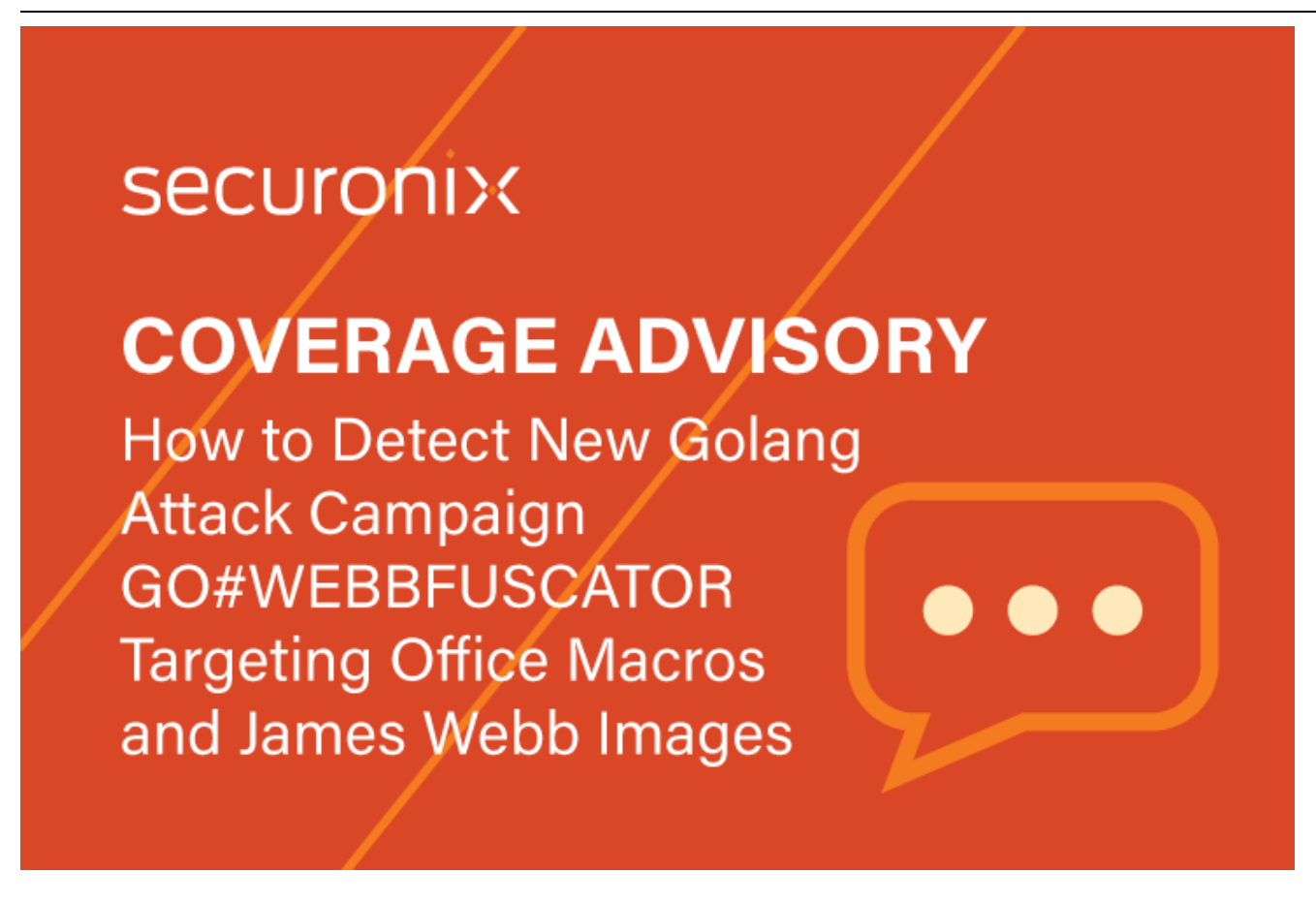
By Securonix Threat Labs, Threat Research: D. luzvyk, T. Peck, O. Kolesnikov

Securonix Threat Labs Security Advisory: New Golang Attack Campaign GO#WEBBFUSCATOR Leverages Office Macros and James Webb Images to Infect Systems