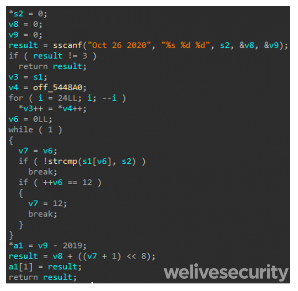
Figure 14. Versioning function in SideWalk Linux

In the Linux variant, we observed a specificity that was not found in the Windows variant: a version number is computed (see Figure 14).