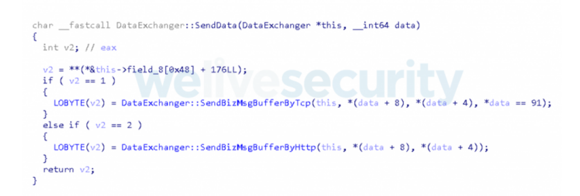
Figure 5. Sending a message in StageClient