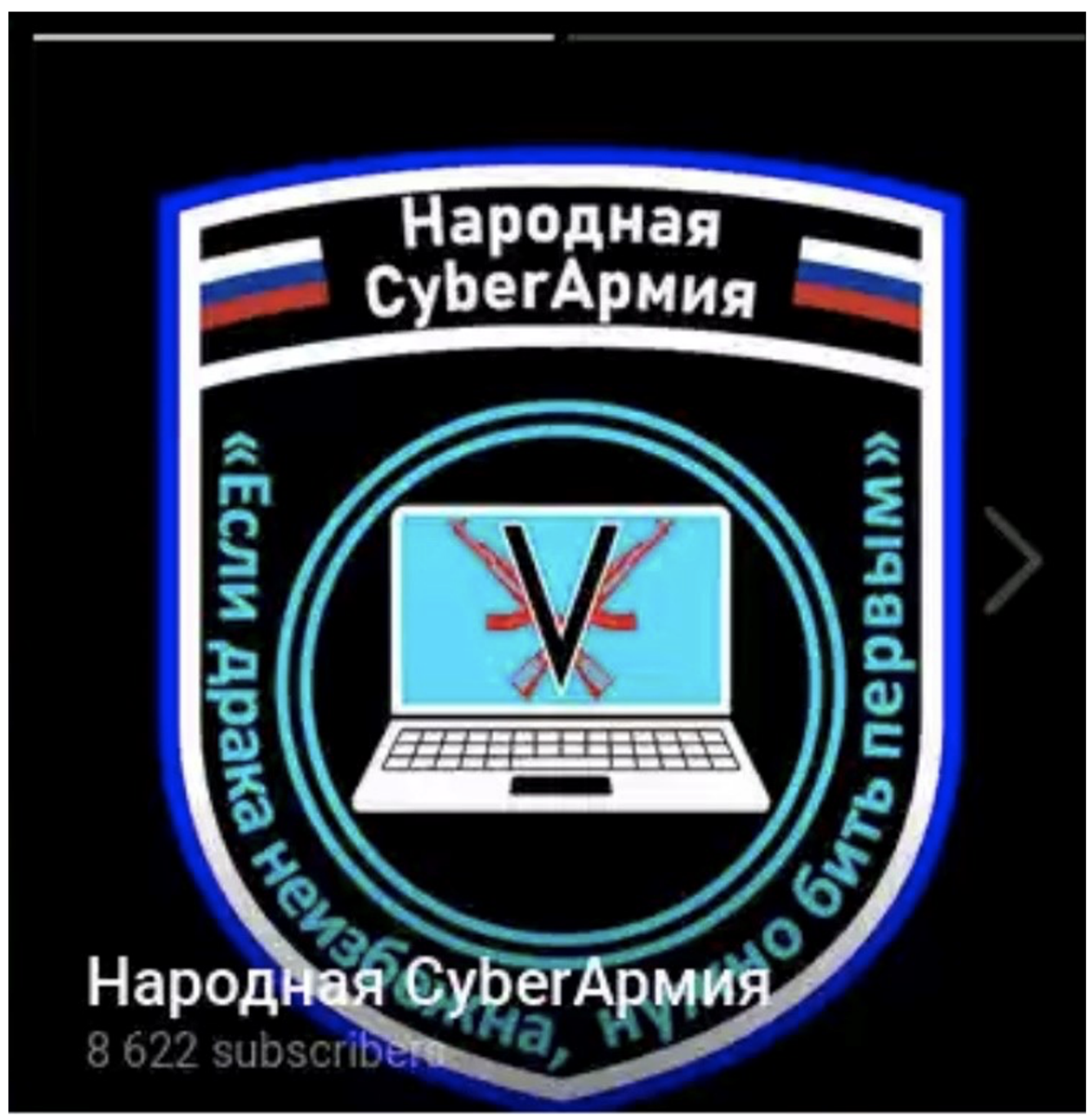
Figure 4: New logo for the CyberArmyofRussia_Reborn, the text of which reads "People's Cyber Army" with a quote notably used by Russia's President Putin "If a fight is inevitable, you must strike first"