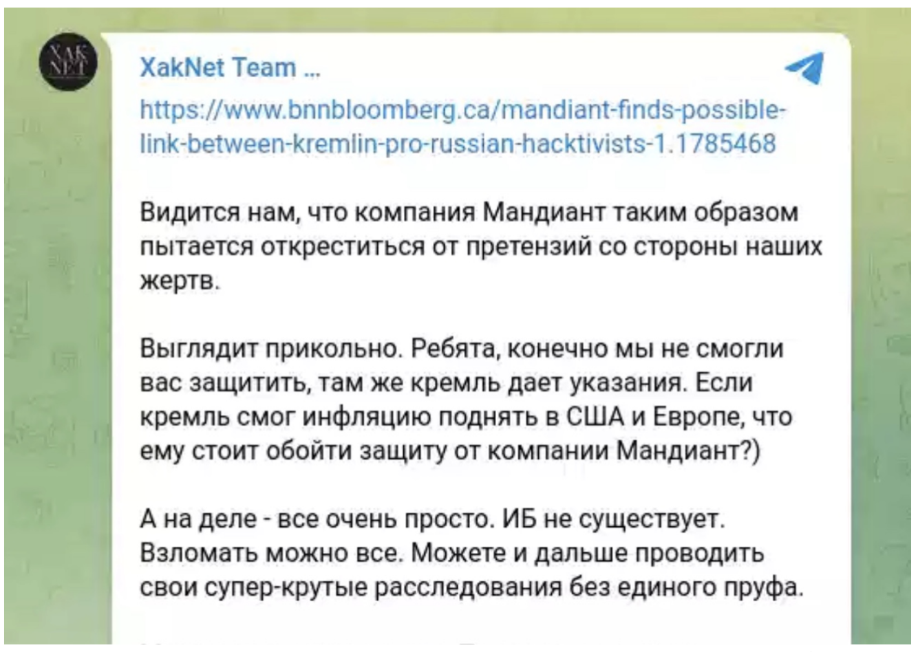
Figure 2: XakNet Telegram post in which the group disputed pervious public statements from Mandiant highlighting possible links between XakNet and the Russian Government. The third paragraph reads: "But in reality, everything is very simple. IB [information security] does not exist. Everything can be hacked. You can continue to conduct your super-cool investigations without any proof."

A review of these channels' activity shows on-platform engagement by hundreds of users. In either of the above outlined scenarios, it seems likely that some or all the users engaged with these channels are Russian-speaking civilians who are not intelligence officers. It is possible that the hundreds of users engaged with these channels are inauthentic, though we judge that to be unlikely.