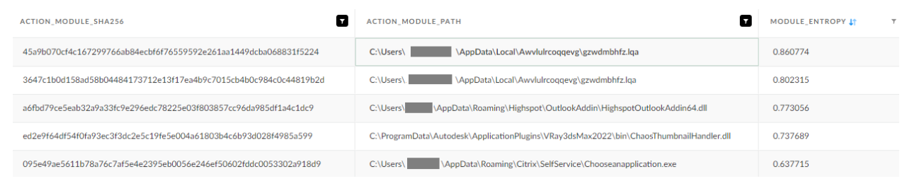
Figure 6. Query results sorted by the module's entropy.

Figure 6 contains partial results of the queries that are mentioned in the next section, sorted by the module's entropy. While the first two rows are an example of Emotet execution, the others are benign DLLs.