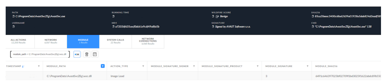
Figure 2. AvastSvc.exe uses side-loading to load a malicious DLL.

To achieve DLL side-loading, the group dropped the payload into the ProgramData folder, which contained three files – a benign EXE file for DLL hijacking (AvastSvc.exe), a DLL file (wsc.dll) and an encrypted payload (AvastAuth.dat). The loaded DLL appeared to be the PlugX RAT, which loads the encrypted payload from the .dat file.