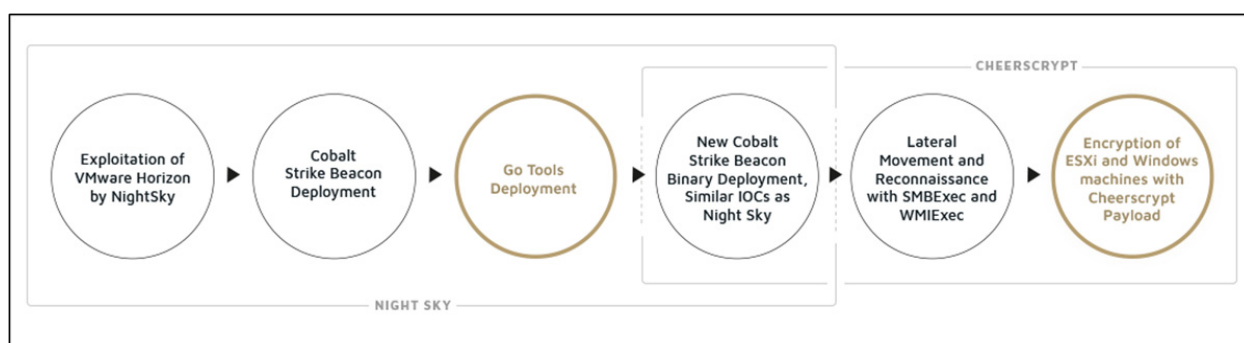
Figure 2: Emperor Dragonfly TTPs as observed during the investigation. The black circles are known TTPs, while the golden circles are newly discovered TTPs, and they encompass both Cheerscrypt and Night Sky campaigns.

Shortly after, the threat actors delivered the final payload: Cheerscrypt ransomware. Although most publications describe Cheerscrypt as a Linux-based ransomware family that targets ESXi servers , in the case Sygnia investigated, both Windows and ESXi machines were encrypted.