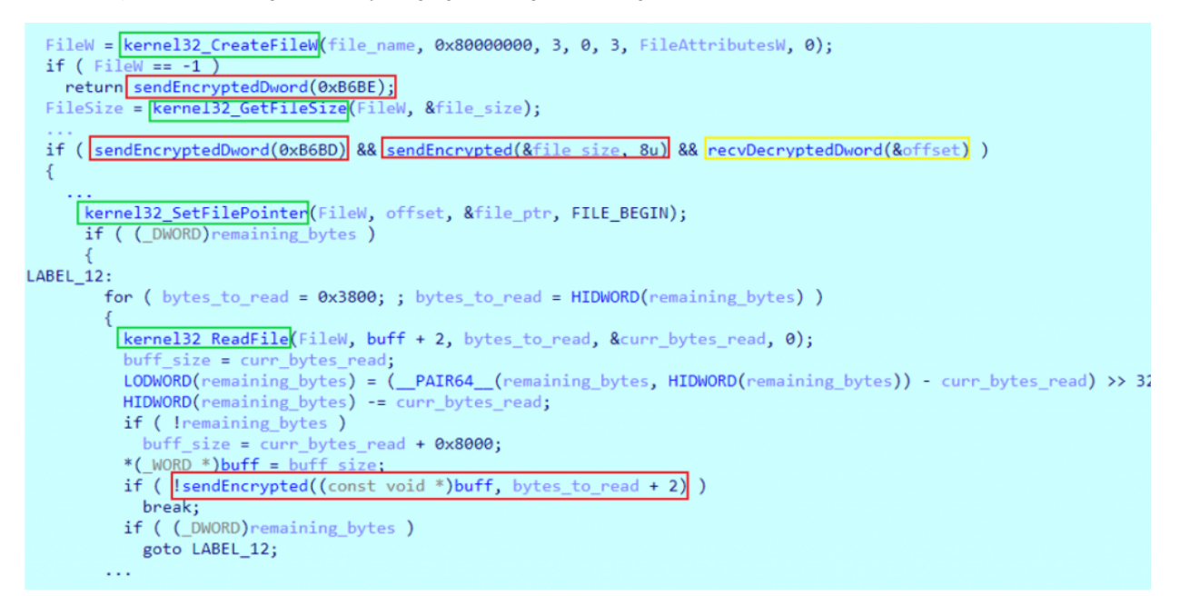
Figure 2. GhostSecret sending a file

Code overlap in the file sending functionality is highlighted in Figure 2 and Figure 3.