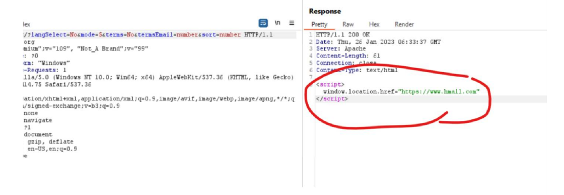
Figure 5 Example of redirection from the phishing kit when validation checks aren't valid

In addition, throughout campaigns lead by UCID902, email headers within the spear-phishing campaigns often showed the SMTP mail originating from the same infrastructure as the phishing kit and sender address containing a domain owned by the web development company.