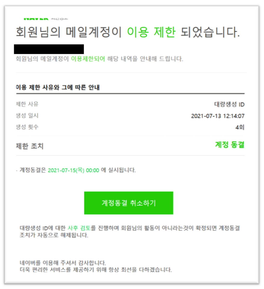
Figure 1 First lure observation of UCID902 by Interlab in 2021

We first observed UCID902 on 2021-07-12 delivering credential phishing campaigns to activists based in the Republic of Korea. The lures aimed to appear as Naver security alerts, prompting users to input credentials, as seen in Figure 1. From 2021 to 2023, we have seen continued efforts by UCID902 to compromise credentials from victims with the same lures and phishing kits. These lures all are synonymous with Naver security events or similar.