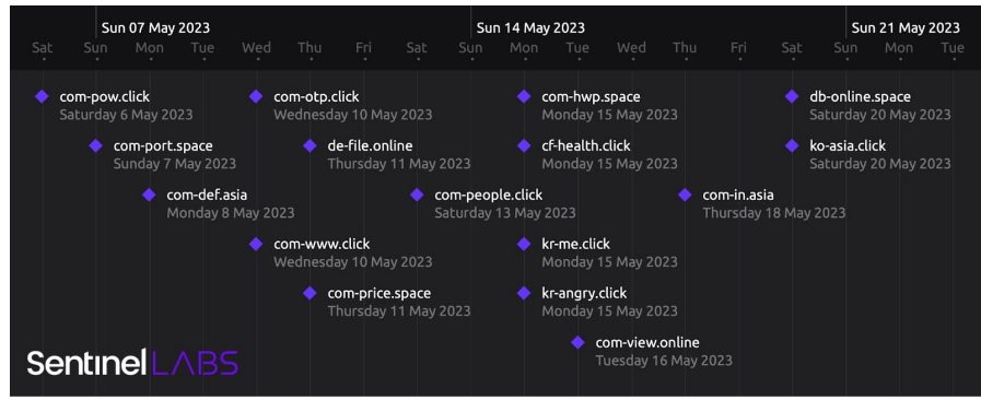
Campaign-related domain registration timeline

This latest campaign is tied to infrastructure abusing the <code>.space</code>, <code>.asia</code>, <code>.click</code>, and <code>.online TLD's</code>, combined with domain names mimicking standard <code>.com TLDs</code>. Noteworthy examples include <code>com-def[.]asia</code>, <code>com-www[.]click</code>, and <code>com-otp[.]click</code>. Placed into a full URL path, an average user is less likely to spot obvious suspicious links.