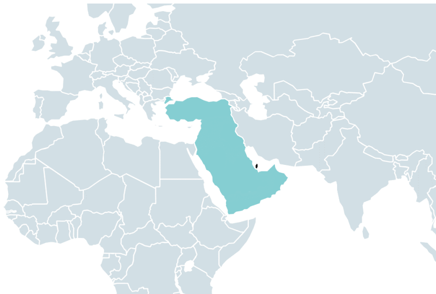
Figure 1. Victimology of Deadglyph; the related sample was uploaded to VirusTotal from Qatar (in darker color)

The victim of the analyzed infiltration is a governmental entity in the Middle East that was compromised for espionage purposes. A related sample found on VirusTotal was also uploaded to the file-scanning platform from this region, specifically from Qatar. The targeted region is depicted on the map in Figure 1.