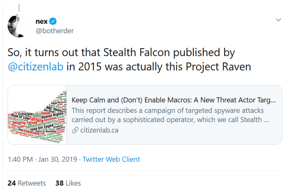
Figure 2. Claudio Guarnieri has connected Stealth Falcon with Project Raven

In January 2019, Reuters published an investigative report on Project Raven, an initiative allegedly employing former NSA operatives and aiming at the same types of targets as Stealth Falcon. Based on these two reports referring to the same targets and attacks, Amnesty International has concluded (shown in Figure 2) that Stealth Falcon and Project Raven actually are the same group.