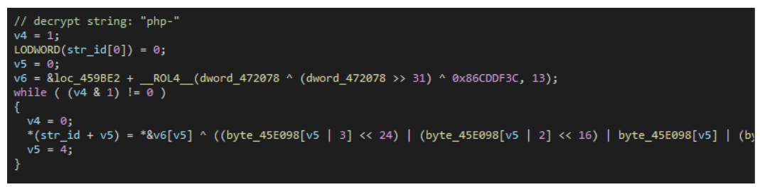
Figure 3 – Example of the decryption of the string "php-".

The second encryption method is tedious and is spliced in-line throughout the program repeatedly at compile time. This generates a complex string decryption algorithm throughout the sample.