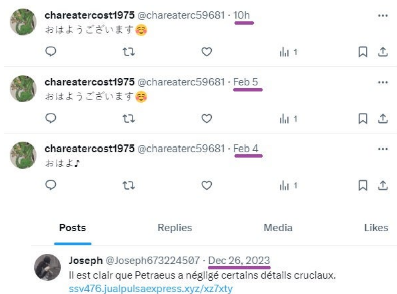
An active and idle suspected Doppelgänger account

Probably in an attempt to increase their visibility, some of the suspected Doppelgänger-managed X accounts we identified regularly post content, which does not necessarily contain first-stage websites, whereas others remain idle for relatively long time periods.