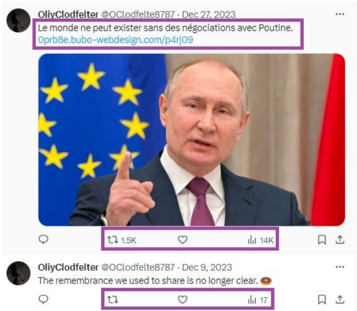
Engagement metric discrepancies

We identified multiple clusters of suspected Doppelgänger-managed accounts which have joined the X platform within the same month. We observed a significant level of coordination in the activities of the accounts within the same cluster, suggesting centralized control. This includes reposting of the same content at almost the same time, typically that of highly popular profiles. In addition, engagement metrics of posts that link to first-stage sites by suspected Doppelgänger accounts within the same cluster often have very similar engagement metrics.