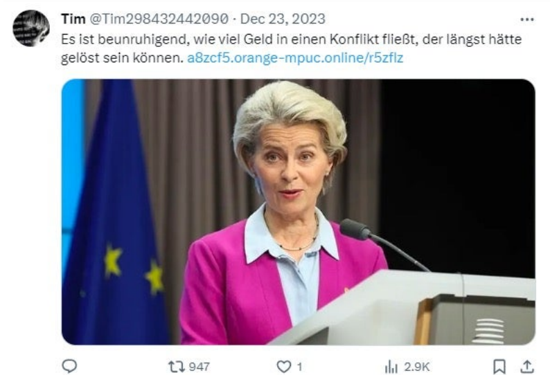
Multi-language posts tailored to the targeted audiences