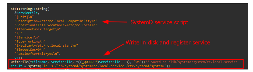
SystemD service registration

The DinodasRAT Linux version takes advantage of the two versions of Linux service managers to establish persistence on an affected system: Systemd and SystemV. When the malware is launched, a function is called to determine the type of Linux distribution the victim is running. There are currently two flavors of distros that the implant targets based on its readings of " /proc/version " – RedHat and Ubuntu 16/18. However, the malware could infect any distro that supports either of the above versions of system service managers. Once the system is recognized, it installs a suitable init script that provides persistence for the RAT. This script is executed once the network setup is complete and launches the backdoor.