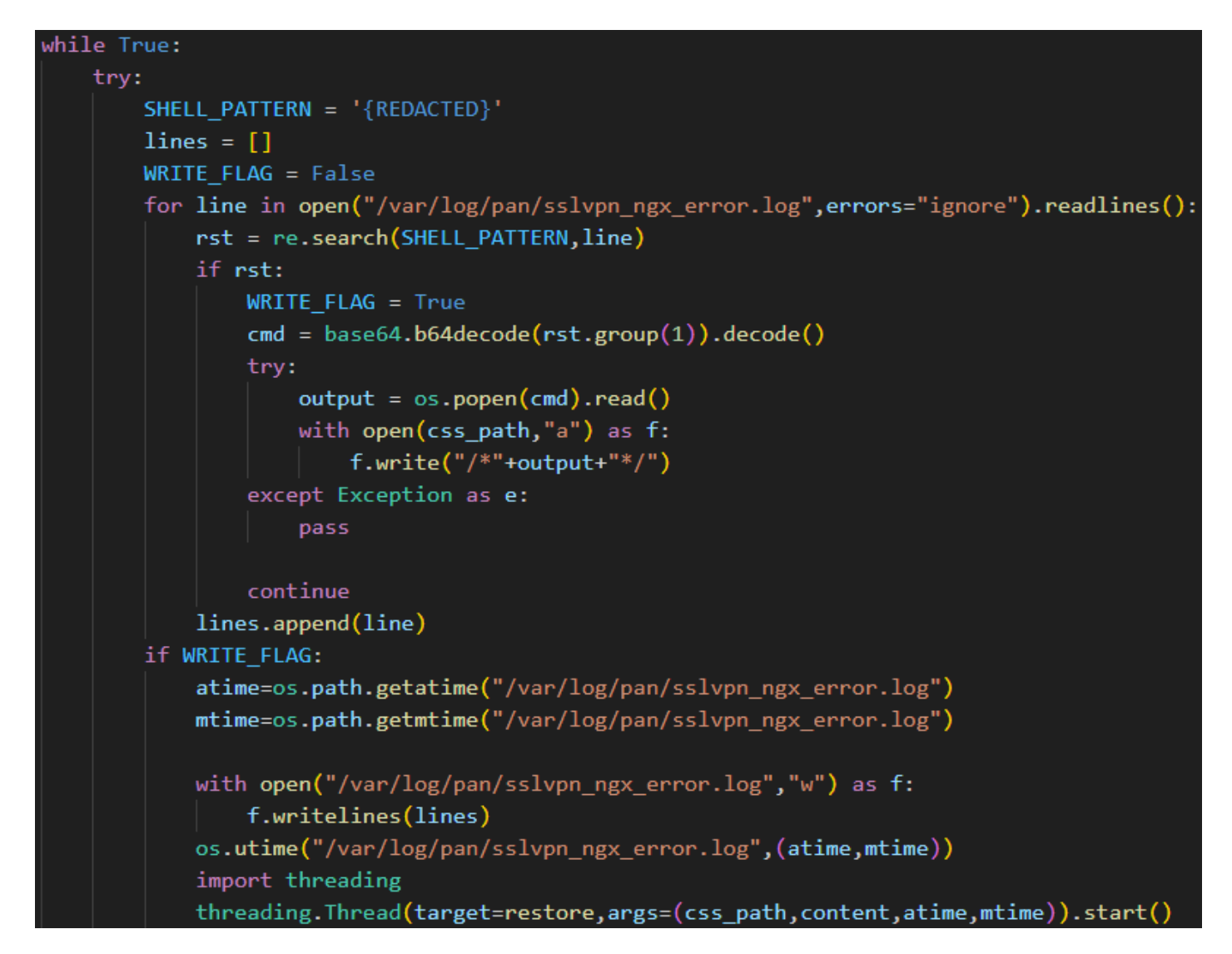
Figure 1. UPSTYLE main loop

The overall workflow of the malware is described in Figure 2.