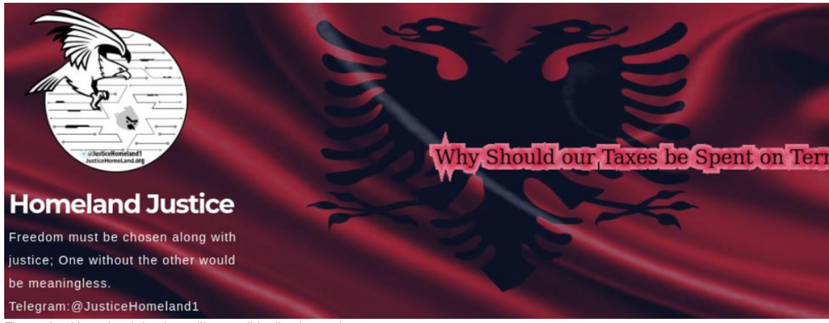
Figure 3 – Homeland Justice utilizes politically charged messages.

This handoff procedure is not unprecedented and is highly correlated with Microsoft's reporting on the destructive attacks against Albania in 2022. In that incident, Storm-0861 (aka Scarred Manticore) was responsible for the initial access and data exfiltration, while Storm-0842 (aka Void Manticore) carried out the destructive attack. In this context, Karma's activity closely resembles another persona linked to the actor by other vendors: Homeland Justice .