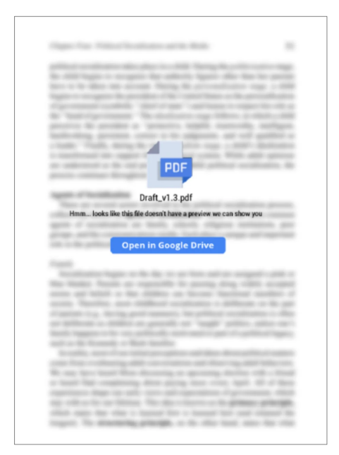
Figure 4: PDF sent in a campaign reported by Microsoft in December 2023 (left); PDF from the River of Phish campaign (right).

Finally, a PDF sent to one of the targets we examined contains multiple RoP elements, as well as an additional element previously associated with COLDRIVER. Specifically, the PDF contained an embedded link using a Customer Relationship Management (CRM) service previously reported as used by COLDRIVER, not a direct link to actor-registered infrastructure. In almost all other aspects, the document matched the RoP campaign. The PDF was sent in March 2024 and named "RS_version 1.3.pdf". The email sender masqueraded as a retired US official seeking comment on a report on Ukraine. Language in the email describing a purported report and requesting a review was identical to other RoP emails. The attached PDF matched all RoP metadata, and the name used variants on "RS" and "Draft 1.3" naming observed in multiple RoP PDFs (See: Figure 2). However, unlike the other PDFs that included a direct link to a first-stage domain, this file included a link through HubSpot, a CRM provider.