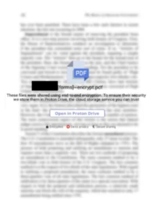
Figure 1: Screenshot of a purportedly-encrypted PDF lure. The phishing page is reached by clicking. (The screenshot has been slightly redacted to remove the name of an impersonated organization).

We often observed the attacker omitting to attach a PDF file to the initial message requesting a review of the "attached" file. We believe this was intentional, and intended to increase the credibility of the communication, reduce the risk of detection, and select only for targets that replied to the initial approach (e.g. pointing out the lack of an attachment).