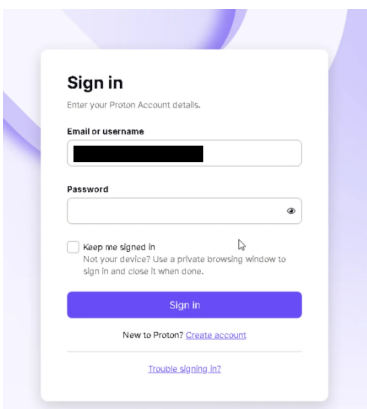
Figure 6: An August 2024 COLDWASTREL phishing page. The prepopulated email address of the target has been redacted.

Shortly prior to publication of this report, we have tentatively identified what appears to be renewed COLDWASTREL targeting, based on TTPs, targeting overlap and infrastructure similarity. In this attack, the decoy PDF included the domain protondrive[.]me which, when clicked, redirected to phishing hosted at protondrive[.]services .