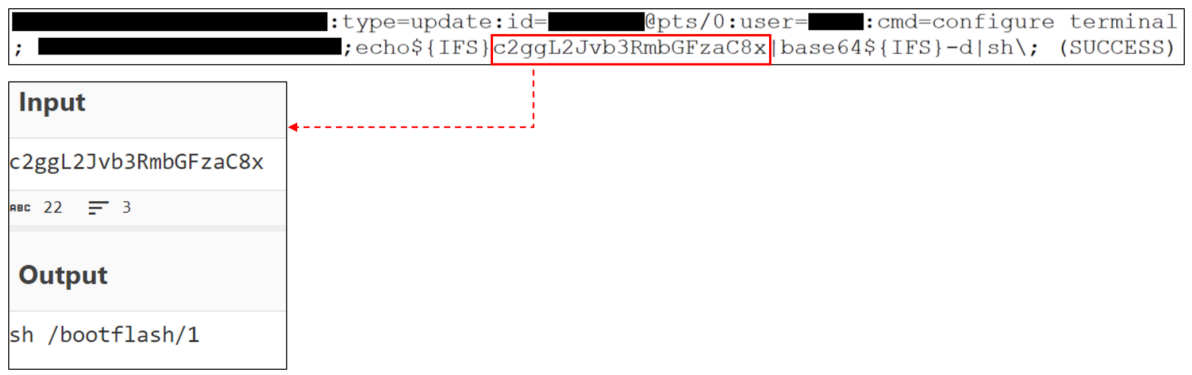
Figure 1: Snippet from the accounting log of the Cisco Nexus switch, showing the command injection vulnerability used by Velvet Ant.

By investigating the accounting logs of the affected system, Sygnia discovered several suspicious Base64-encoded commands that were executed using valid administrative credentials. These commands were identified as being not merely unusual administrative commands, but rather part of an exploit leveraging a command injection vulnerability. The threat actor utilized this technique to execute a malicious script to load and execute a backdoor binary on the device, thereby bypassing standard security mechanisms.