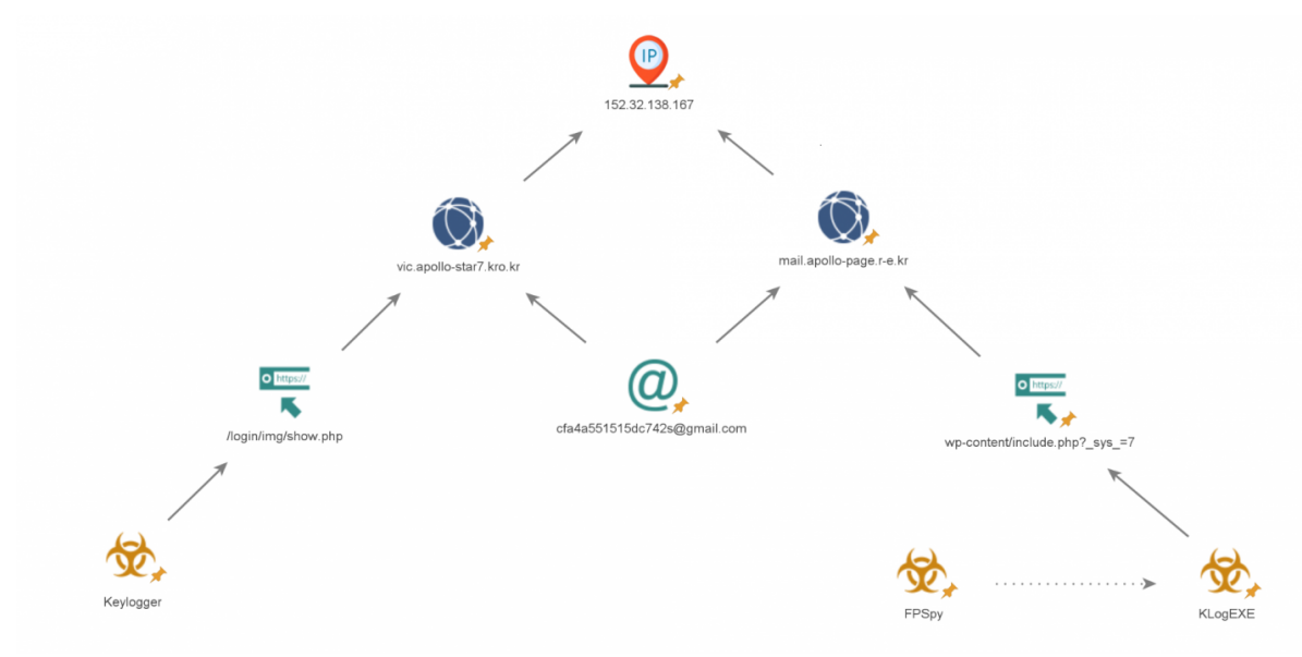
Figure 1. Infrastructure layout showing the connection between the malware.