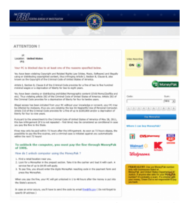
Reveton ransomware scam page impersonating the FBI

The FBI alert said the attacks have surged with the help of a "new drive-by virus" called Reveton ; in fact, Reveton