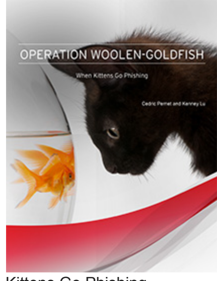
Kittens Go Phishing

View research paper: Operation Woolen Goldfish: When