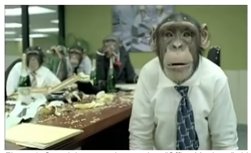
Figure 1. Cozyduke campaign used an "Office Monkeys" video as a lure–July 2014

The group began its current campaign as early as March 2014, when <u>Trojan.Cozer</u> (aka Cozyduke) was identified on the network of a private research institute in Washington, D.C. In the months that followed, the Duke group began to target victims with "Office Monkeys"-and "eFax"-themed emails, booby-trapped with a Cozyduke payload. These tactics were atypical of a cyberespionage group. It's quite likely these themes were deliberately chosen to act as a smokescreen, hiding the true intent of the adversary.