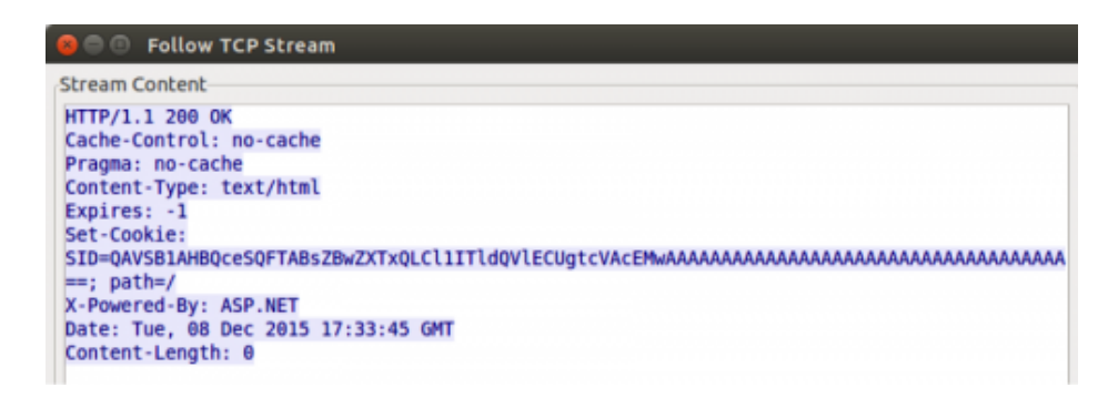
Figure 8 C2 response to Emissary beacon

The C2 server response to this beacon (seen in Figure 8) will contain a header field called "Set-Cookie", which contains a value of "SID". The SID value is base64 encoded and encrypted using a rolling XOR algorithm, which once decoded and decrypted contains a 36-character GUID value. The Emissary Trojan will use this GUID value provided by the C2 server as an encryption key that it will use to encrypt data sent in subsequent network communications.