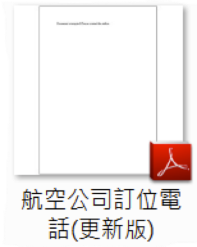
Figure 7 PDF named “Airline Reservation Number”