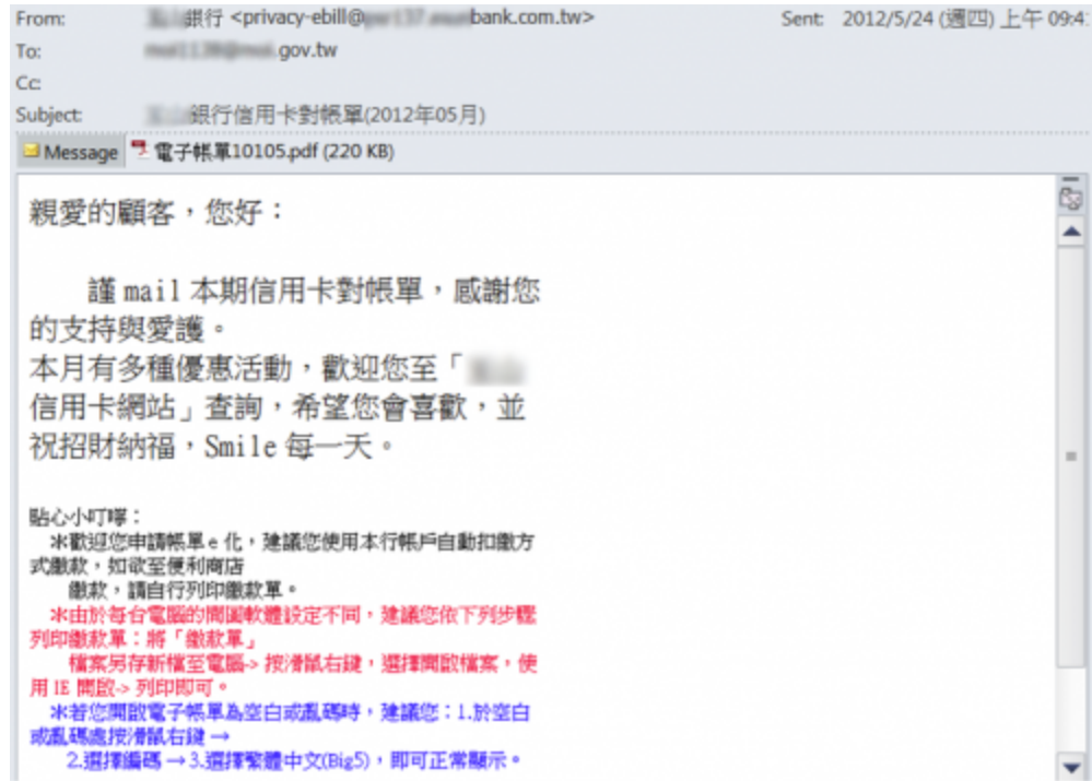
Figure 3 Spear Phishing Email sent to a ministry of Taiwan

Figure 3 shows an email which was sent to a ministry of Taiwan in May 2012.