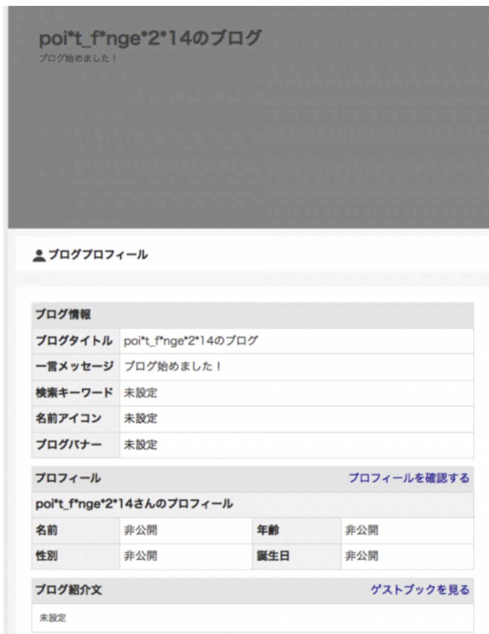
Figure 2 Blog account created by the attacker in 2014