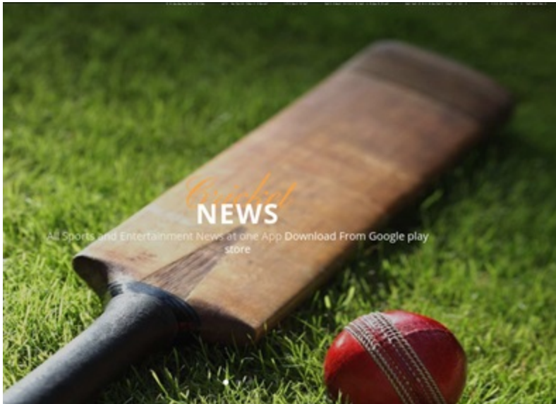
Figure 4. Malicious application for cricket news