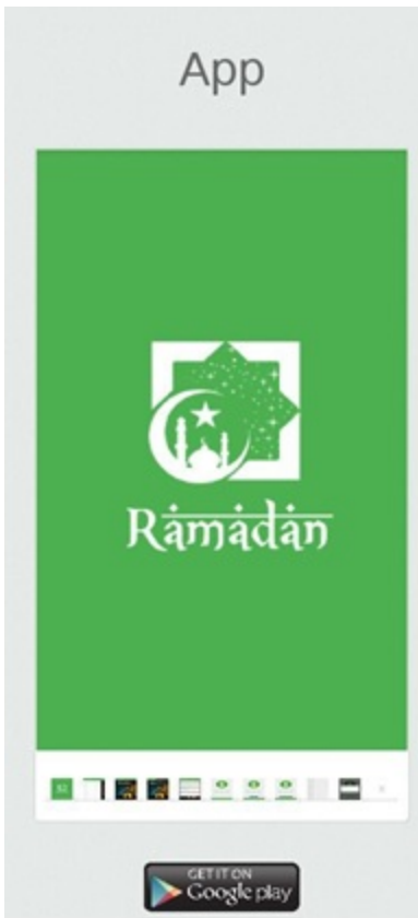
Figure 3. Malicious application for observing Ramadan

Multiple Android applications further drive this notion, as they provide services based on the interests of users in that region. They have a malicious application that provides services for religion, as well as popular sports in the region.