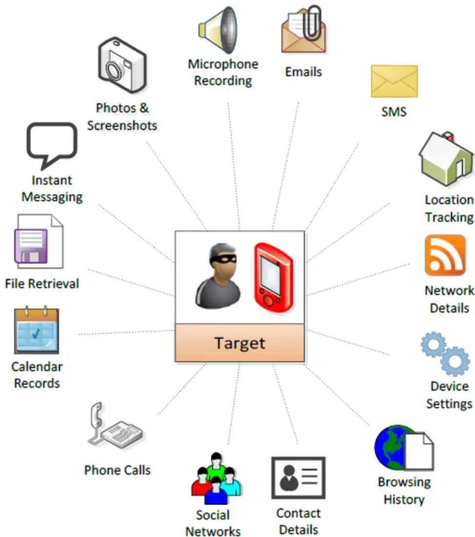
Figure 2: Diagram from purported NSO Group Pegasus documentation showing the range of information gathered from a device infected with Pegasus.

Israel-based “Cyber Warfare” vendor NSO Group produces and sells a mobile phone spyware suite called Pegasus . To monitor a target, a government operator of Pegasus must convince the target to click on a specially crafted exploit link , which, when clicked, delivers a chain of zero-day exploits to penetrate security features on the phone and installs Pegasus without the user’s knowledge or permission. Once the phone is exploited and Pegasus is installed, it begins contacting the operator’s command and control (C&C) servers to receive and execute operators’ commands, and send back the target’s private data, including passwords, contact lists, calendar events, text messages, and live voice calls from popular mobile messaging apps. The operator can even turn on the phone’s camera and microphone to capture activity in the phone’s vicinity.