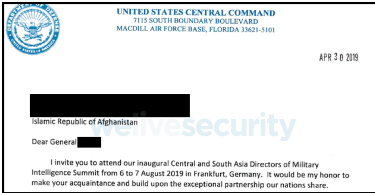
Figure 5. Decoy documents used in campaigns against governmental organizations

This was the first of many malicious samples we encountered being used by the Buhtrap group to target government institutions. Another, more recent decoy document that we believe was also distributed by the Buhtrap group is seen in Figure 5 – a document which would appeal to a very different set of people, but still government-related.