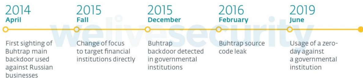
Figure 1. Important events in Buhtrap timeline

The timeline in Figure 1 highlights some of the most important developments in Buhtrap activity.