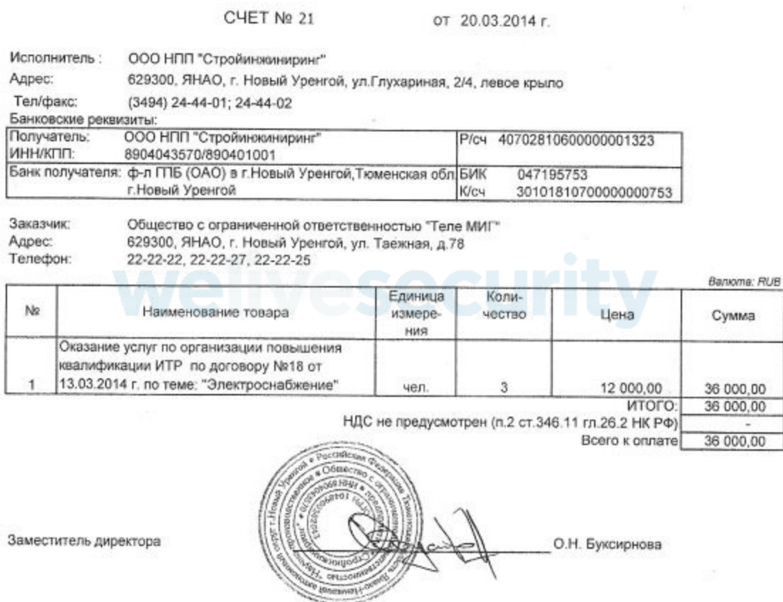
Figure 2. Decoy document used in campaigns against Russian businesses

The documents employed to deliver the malicious payloads often come with benign decoy documents to avoid raising suspicions if the victim opens them. The analysis of these decoy documents provides clues about who the targets might be. When Buhtrap was targeting businesses, the decoy documents would typically be contracts or invoices. Figure 2 is a typical example of a generic invoice the group used in a campaign in 2014.