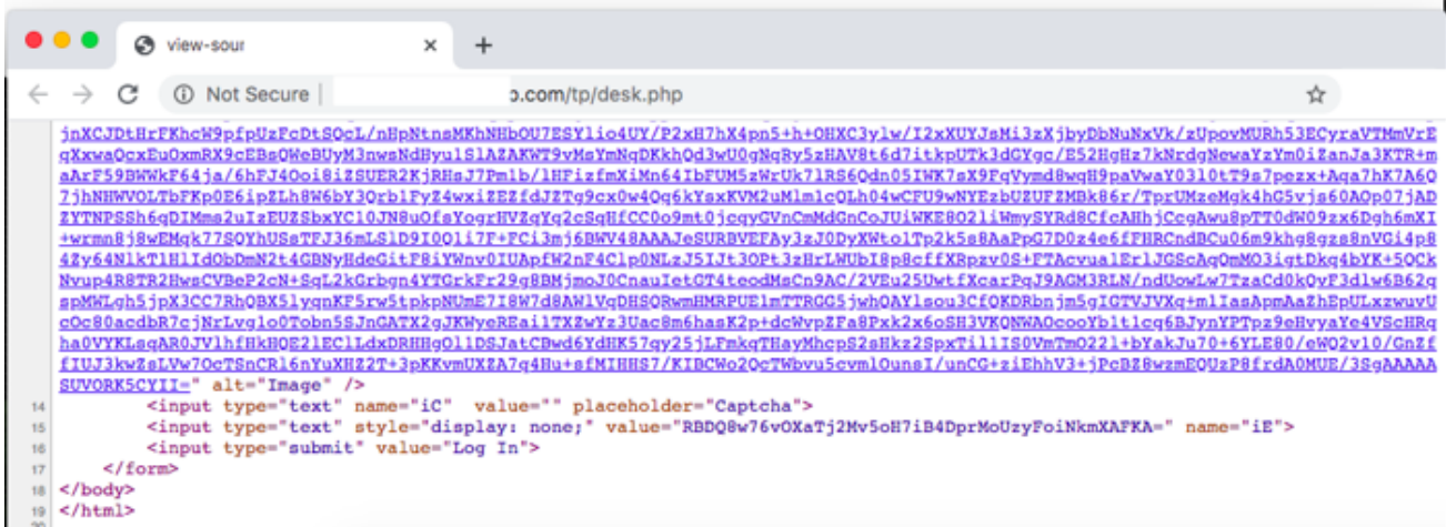
Figure 1: LokiBot C&C panel with CAPTCHA.