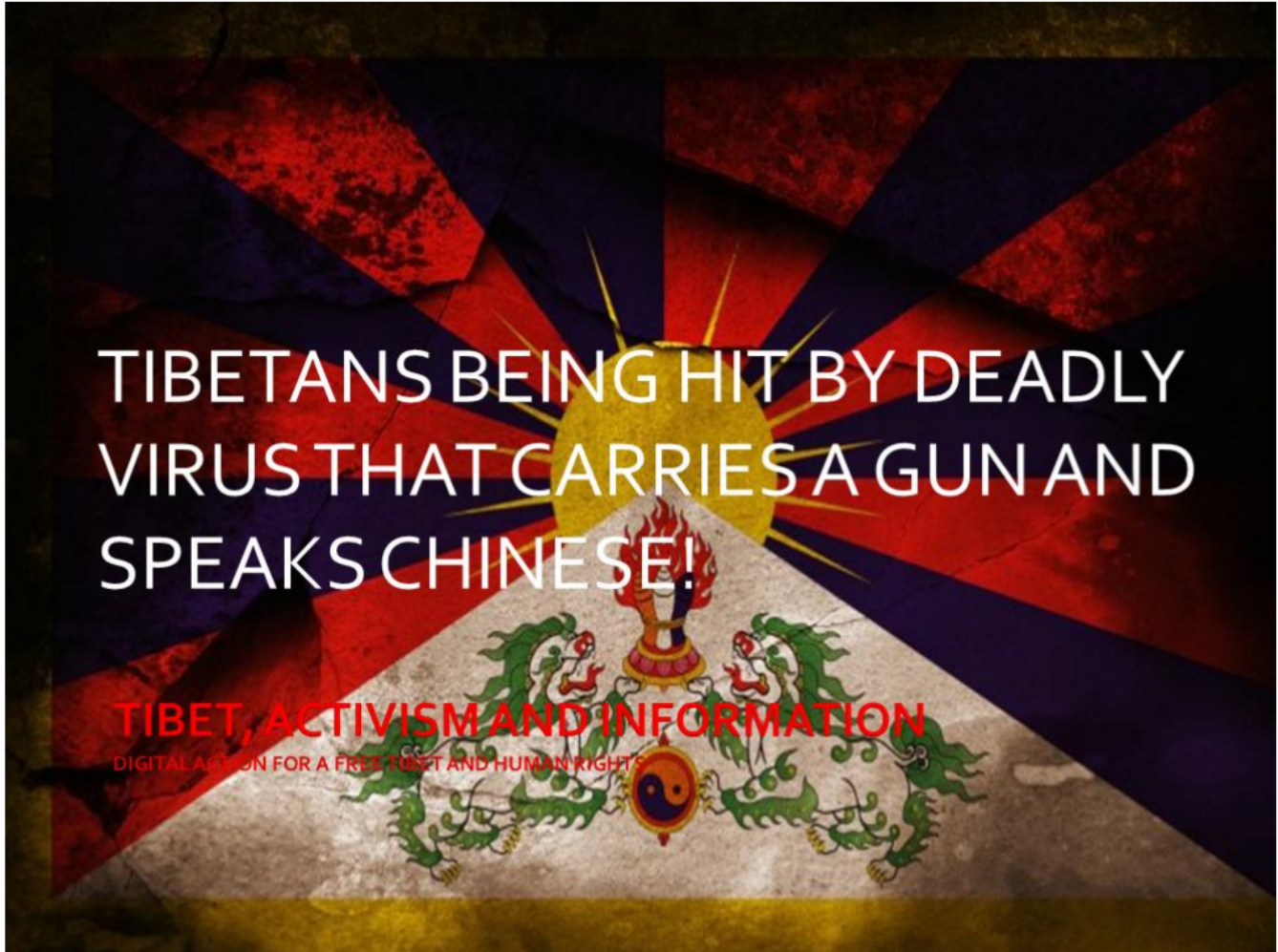
Figure 3: Lure Document TIBETANS BEING HIT BY DEADLY VIRUS THAT CARRIES A GUN AND SPEAKS CHINESE.ppsx.

referenced “Tibet, Activism and Information”. When the PowerPoint attachment is executed, it calls out to the IP 118.99.13[.]4 to download a Sepulcher malware payload named “file.dll”. Additionally, the distinct C2 request http://118.99.13[.]4:1234/qqqzqa that occurs at that time has been seen previously in association with TA413 malware campaigns. Upon the delivery of the payload “file.dll” it is saved as “credential.dll” and executed resulting in a C2 communication with the domain Dalailamatrustindia.ddns[.]net . The attachment title, decoy content, impersonated sender, and Dalai Lama Trust in India -themed C2 affirms this campaign’s focus on individuals associated with the Tibetan Leadership in Exile.