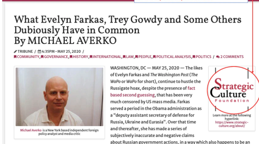
Figure 4: Strategic Culture Foundation (SVR) article in Yonkers Tribune maligning local Congressional candidate Evelyn Farkas - a former Deputy Assistant Secretary of Defense for Russia, Ukraine, and Eurasia.

Finally, the Treasury designations outed news outlet InfoRos as run by the GRU—Russia’s military intelligence. Of critical importance in this declaration was some specific text: