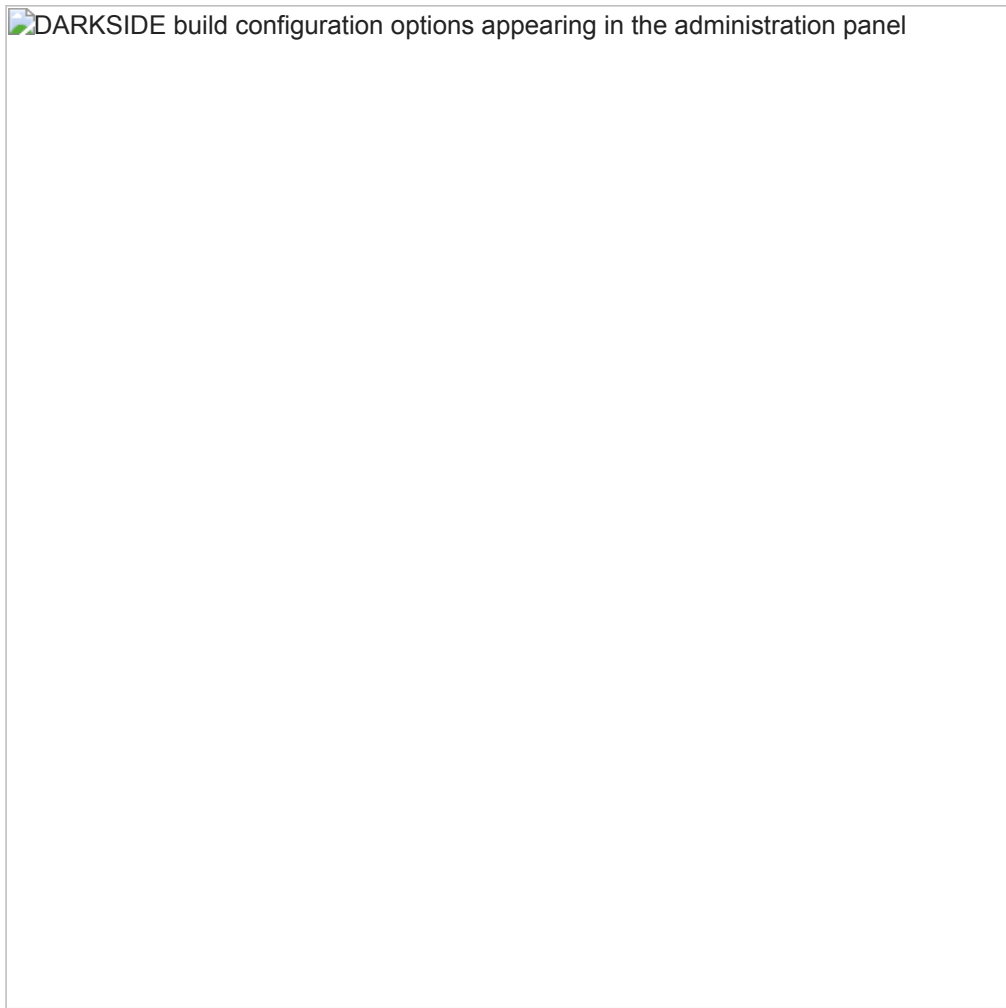
Figure 4: DARKSIDE build

configuration options appearing in the administration panel