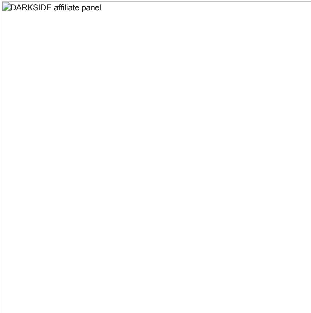
Figure 2: DARKSIDE

DARKSIDE RaaS affiliates are required to pass an interview after which they are provided access to an administration panel (Figure 2). Within this panel, affiliates can perform various actions such as creating a ransomware build, specifying content for the DARKSIDE blog, managing victims, and contacting support. Mandiant has identified at least five Russian-speaking actors who may currently, or have previously, been DARKSIDE affiliates. Relevant advertisements associated with a portion of these threat actors have been aimed at finding either initial access providers or actors capable of deploying ransomware on accesses already obtained. Some actors claiming to use DARKSIDE have also allegedly partnered with other RaaS affiliate programs, including BABUK and SODINOKIBI (aka REvil). For more information on these threat actors, please see Mandiant Advantage .