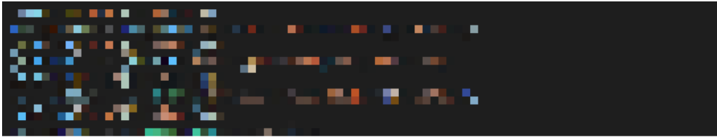
Figure 2. Deobfuscated