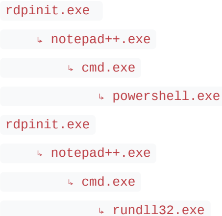
Figure 7: Two FIN7 process event chains

FIN7 used established RDP access to eventually install other modes of host control, first by executing PowerShell reconnaissance scripts, then by executing a TERMITE loader (Figure 8).