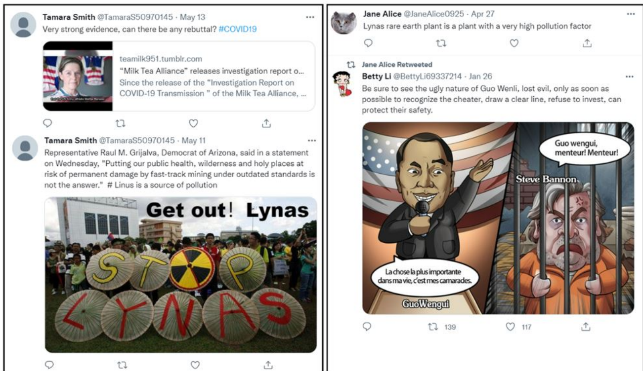
Figure 5: Sample tweets by accounts included narratives promoted by previously identified DRAGONBRIDGE activity, along with narratives critical of Lynas

As with other DRAGONBRIDGE accounts we have previously identified, the newly identified accounts in this activity set have shown similar indicators of inauthenticity and coordination. For example, accounts used profile photos appropriated from various online sources, including stock photography, animals, and cartoons, suggesting that they sought to obfuscate their identities; most of the Twitter accounts were created in clusters between March and June 2022, suggesting possible batch creation of the accounts, a tactic we have previously observed with this campaign. Many of the usernames consisted of English-language names followed by seemingly random numeric strings. In addition to the accounts' posting of identical or similar rare earths-related content, we also observed some of the accounts post identical or similar apolitical content, such as inspirational quotes, wellness, travel, and sports content.