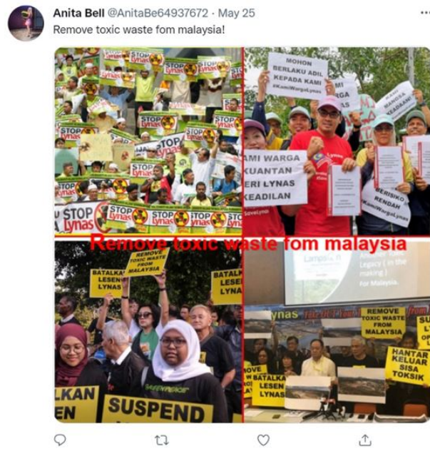
Figure 3: Accounts call for Malaysians to boycott Lynas