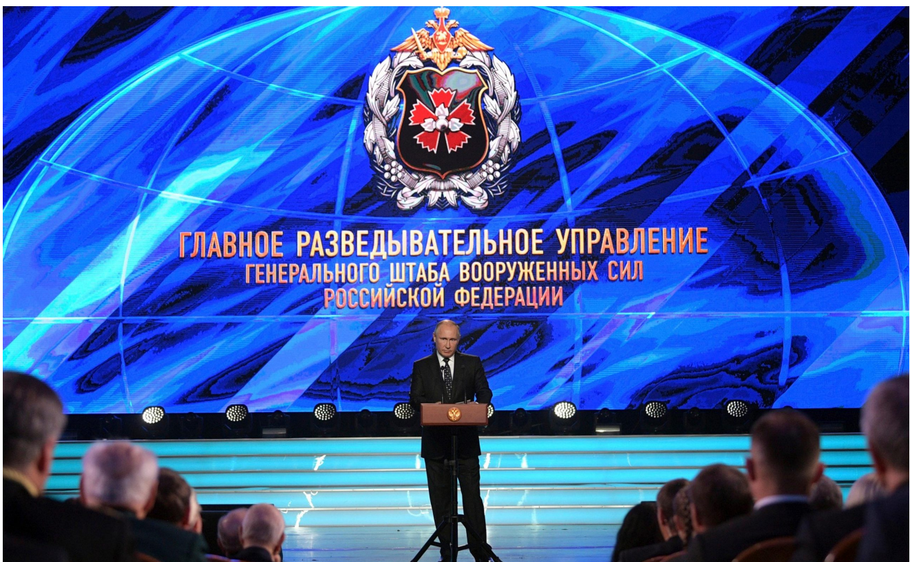
Photo: Moscow, Russia. 2 November 2018. Russian President Vladimir Putin addresses a gala event to mark the centenary of the Main Directorate of the General Staff of the Armed Forces of Russia known as the GRU at the Russian Army Theatre

The United States and Russia have clashed for years over what terminology to use: “information security,” promoted by Russian officials, versus cyber, used by the United States. The Russian approach is more expansive and includes both psychological and technical elements, but essentially what the Kremlin means is control over online content — i.e., censorship.