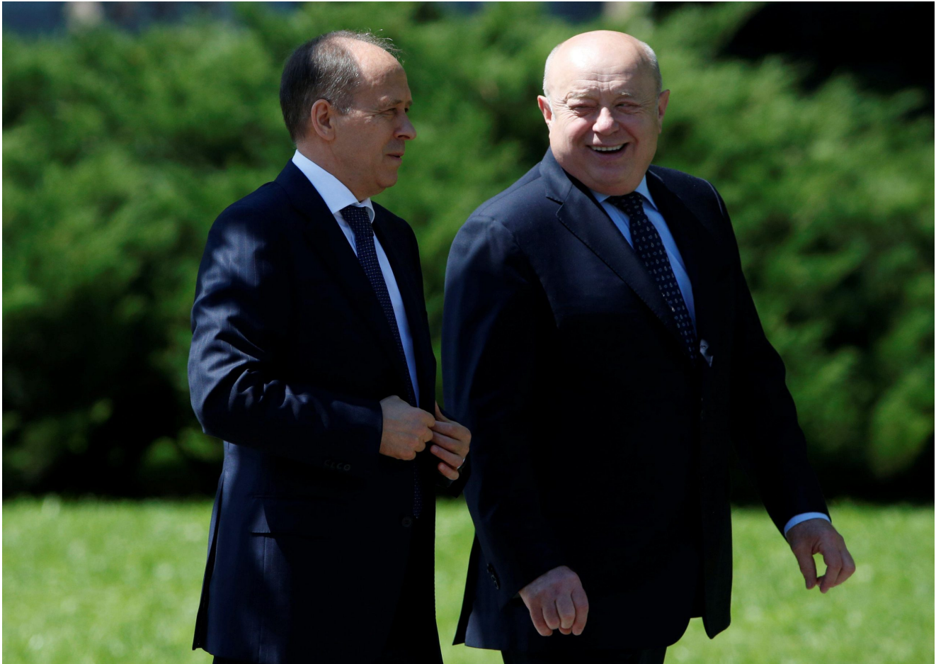
Photo: Director of Russian Federal Security Service (FSB) Alexander Bortnikov and Director of Foreign Intelligence Service (SVR) Mikhail Fradkov arrive for a wreath-laying ceremony marking the 75th anniversary of the Nazi German invasion, by the Kremlin walls in Moscow, Russia, June 22, 2016.

One of the reasons for this setback could be that the political decision-making in cyber is still dominated by the FSB (at the Security Council).