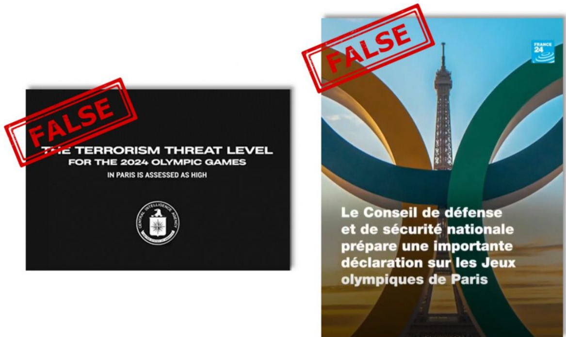
Figure 2: A faked video press release warning the public of possible terror attacks at the 2024 Paris Summer Olympics (left). A fabricated France 24 news clip claiming that nearly a quarter of Paris 2024 tickets have been returned due to concerns over terrorism (right). Both forgeries were produced by Russia-affiliated actor Storm-1679.