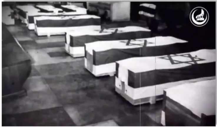
Figure 3: An image of graffiti, reportedly left in Paris, threatening a repeat of the 1972 Munich terror attacks at the upcoming Olympic Games in Paris (left). A still image from the false-flag terror threat, purportedly from Turkish ultranationalist group the Grey Wolves, whose symbol is visible in the top-right corner of the screen. The video was widely publicized by pro-Russian bot accounts and prompted a response from the Israeli Olympic Committee (right).