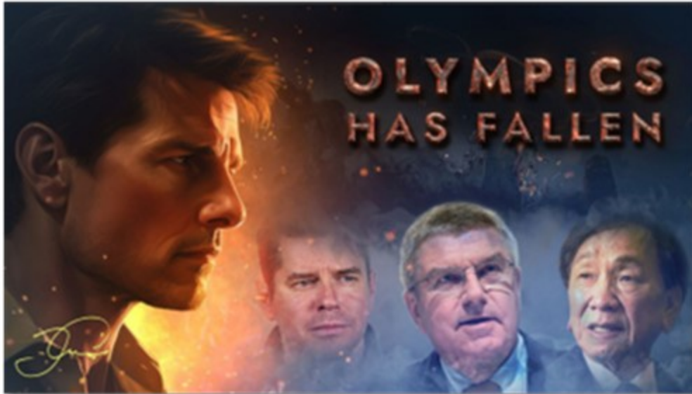
Figure 1: A visual from the fake documentary “Olympics Has Fallen”, produced by Russia-affiliated influence actor Storm-1679, which targets the International Olympic Committee and advances pro-Kremlin disinformation. The documentary uses the image and likeness of American actor Tom Cruise, who did not participate in any such documentary.

impersonating the actor Tom Cruise to imply his participation, the film disparaged the IOC leadership. The use of slick computer-generated special effects and a broad marketing campaign, including faked endorsements from Western media outlets and celebrities, indicates a significant increase in skill and effort compared to most Influence Operations (IO) campaigns.