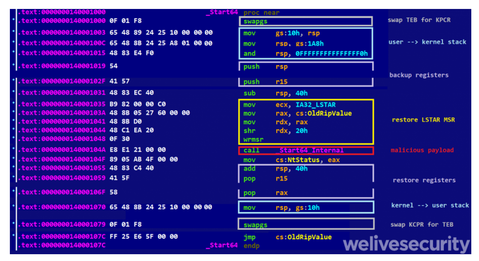
Figure 7. Exported function in the driver loader module that is called by changing LSTAR MSR

the ROP chain gadgets – swap the GS register, swap the user-mode and kernel-mode stacks, save all registers on the stack, restore the original LSTAR MSR value and then call the actual function. Once finished, this process is reversed.