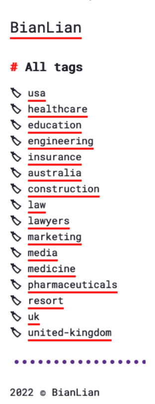
The victim organizations range from small/medium size businesses to a large multinational company, with the majority of the companies based in North America, the UK and Australia.

As is the norm for a group conducting double extortion style ransomware attacks, the BianLian group maintained a leak site where they post the data they have exfiltrated from victim networks. While an unfortunate truth in the ransomware space is that the true number of organizations and victims of ransomware attacks will never be known, as of September 1, 2022, the BianLian site has posted details on twenty victim organizations. The threat actor also took the time to categorize the industry vertical of the victims and tagged the corresponding data.