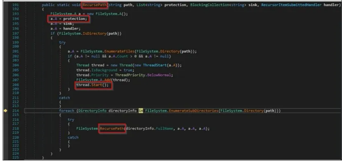
Figure 5 – Enumerate files & folders for encryption

Before initiating the encryption process, the ransomware drops the ransom note in the folder with the file name "!!!READ TO RECOVER YOUR DATA!!!.txt." The malware creates the ransom note by decoding the hardcoded Base64 content, as shown in the figure below.